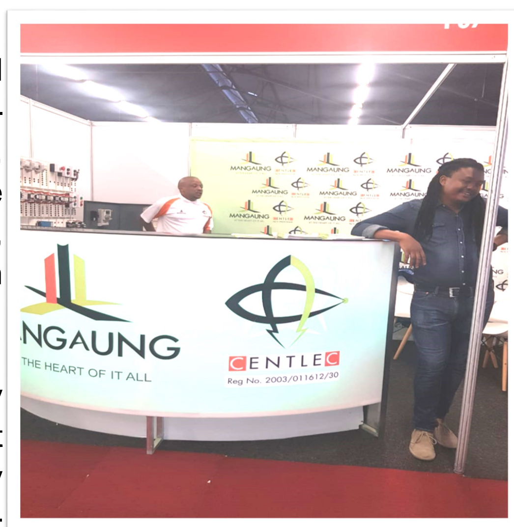
CENTLEC OFFICIALS AT THE STALL DURING 2019 BLOEM SHOW

CENTLEC's participation at the show is one of the initiatives undertaken by the organisation to accelerate provision of services to our communities and also ensure that CENTLEC conforms to the provisions of the Municipal Systems Act and the principles of Batho Pele which advocates for putting the people first in everything that government does.