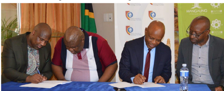
THE SINGING OF THE MoU