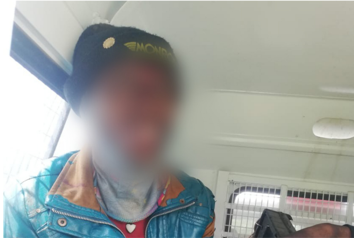
PERPETRATOR (1) APPREHENDED AT THE DUMPING SITE

CENTLEC (SOC) Ltd continues to intensify its efforts of fighting vandalism of valuable infrastructure and theft of copper cables within its area of operation. In October 2022, our security unit successfully apprehended two males in Bloemfontein just outside the dumping site with stolen transformer.