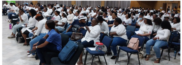
THE WOMEN OF CENTLEC AT THE WOMEN'S SEMINAR

As part of its continuing effort to support women within the Engineering space and to contribute to their personal development as well as to show appreciation for the hard work they put in every day, Centlec (SOC) Ltd, through its Wellness division, hosted a women's seminar on the 12th of October 2022 at Floreat Hall in Bloemfontein.