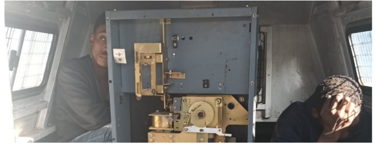
THE PERPETRATORS WITH THE VANDALIZED EQUIPMENT

A case of theft and vandalism of valuable infrastructure was opened at Kagisanong Police station. Both suspects, one of whom was a Lesotho national, were handed over to the South African Police Services. The suspects appeared before the Bloemfontein Magistrate courts where they were denied bail. They are currently under police custody.